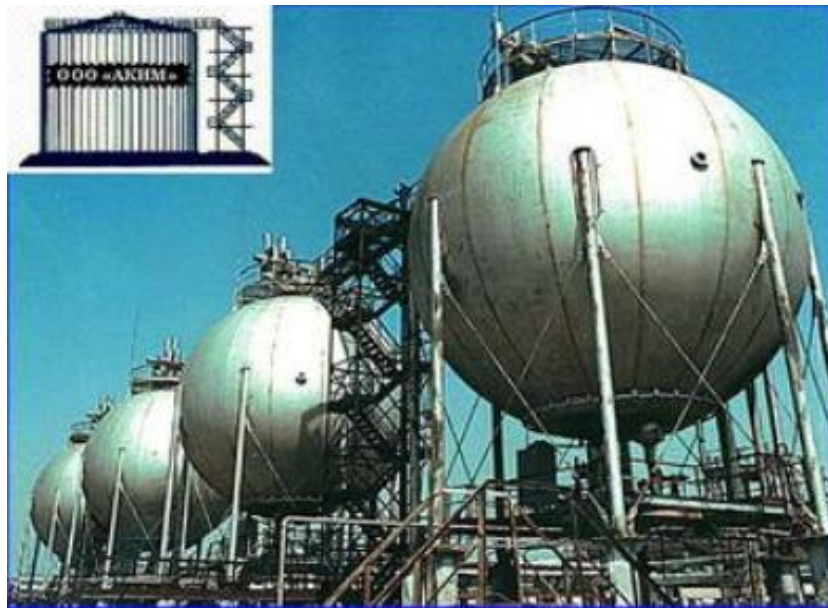
*sample of possible works