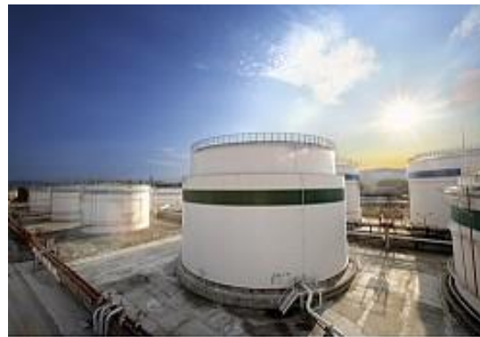
*sample of possible works